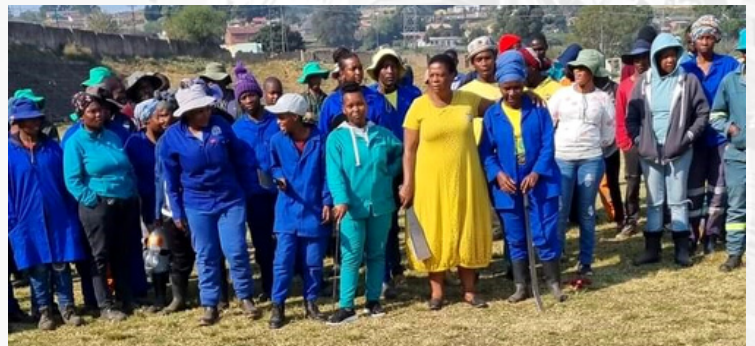
Photo 3 and 4: the Ward 40 Councillor collaborated with civil society organizations to commemorate the 67 minutes of the late Nelson Mandela by initiating a cleaning project within the ward. The campaign is at its teething stage since it began by removing undesirable shrubs at Sweetwaters stadium. The programme is intended to escalate to other areas to keep the ward environmentally clean with no litter and unnecessary shrubs.