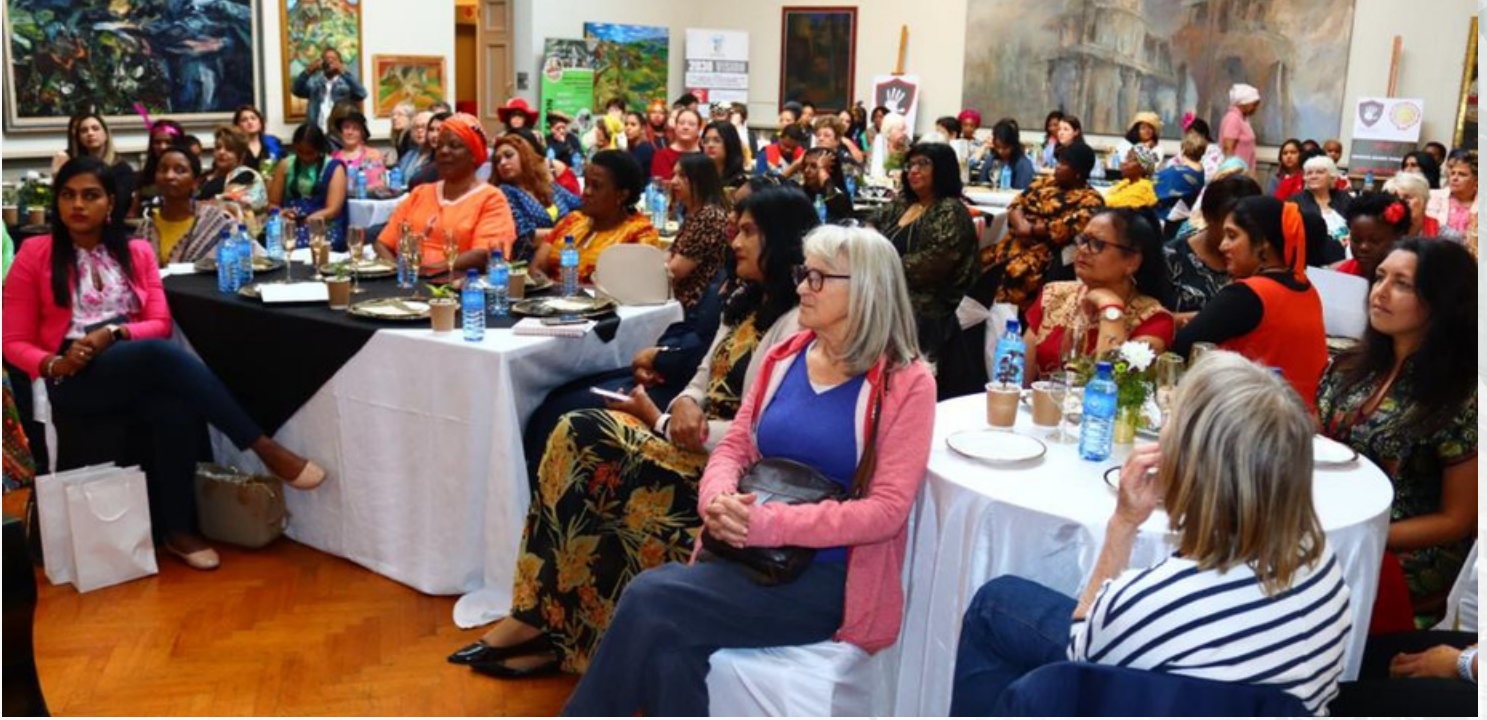
Msunduzi Municipality's Tatham Art Gallery hosted a Women's Tea and Talk in celebration of Women's Month and explored the W.O.M.A.N. Exhibition.