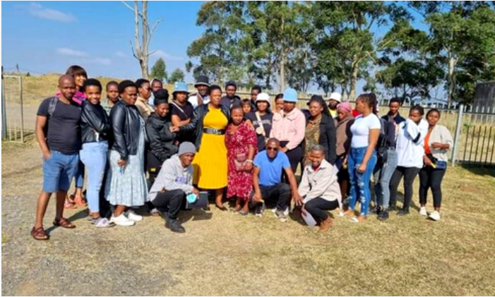
Photo 1: The office of the Ward 40 Councillor along with the Vulindlela ABM office coordinated a much-needed programme targeting the unemployed graduates within the ward. This informative workshop was jointly presented by the Human Sciences Research Council (HSRC) in partnership with Umzansi Youth in Business (UYB). The graduates were equipped with labour market skills such as CV writing and handling interview questions. The Ward Council office also compiled a database of graduates to advise them to apply when vacancies arise.