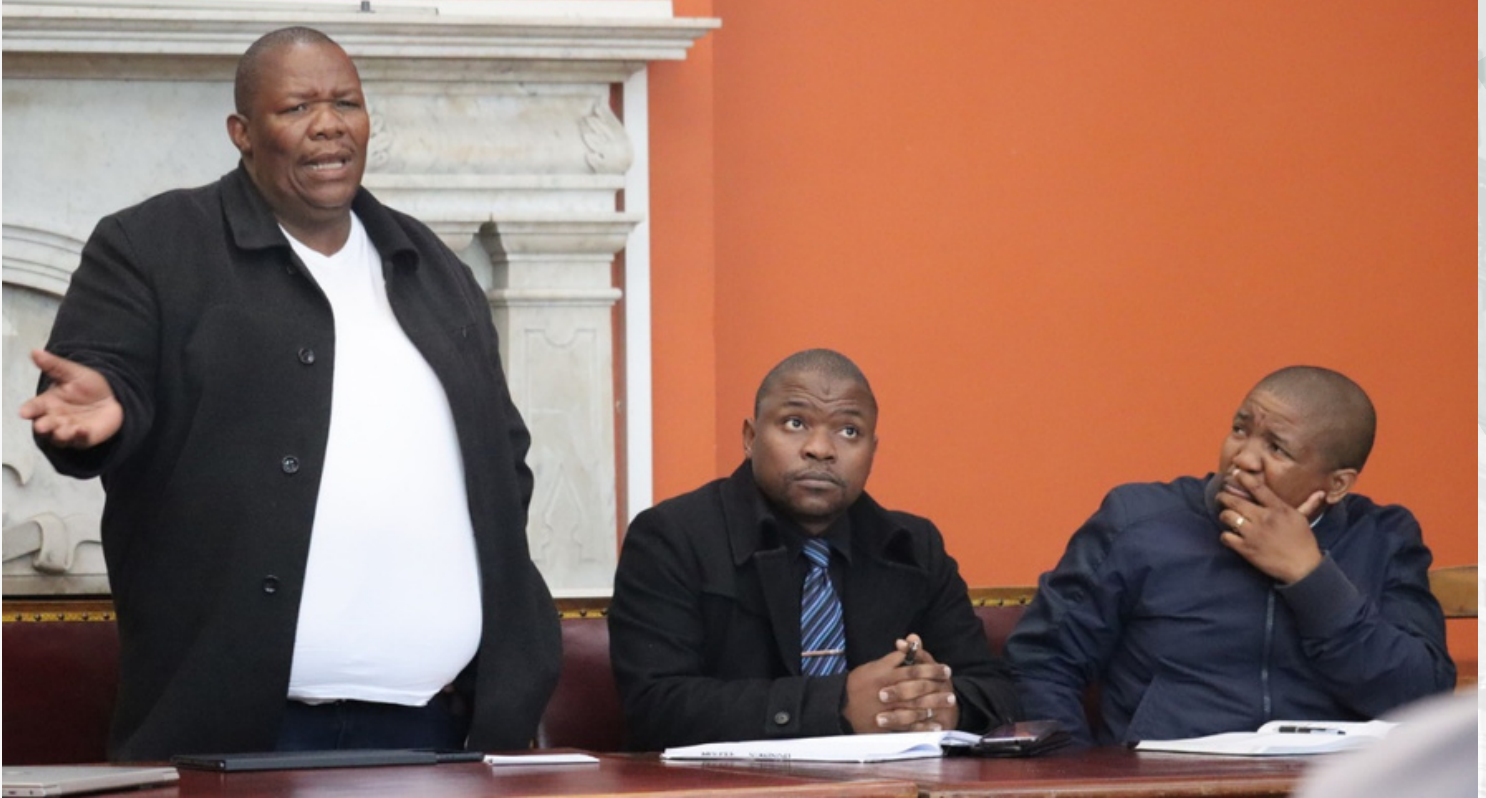
Mayor Mzimkhulu Thebolla met with local business owners to discuss issues affecting them and to build a relationship with them in-order to be able to work together to find solutions.